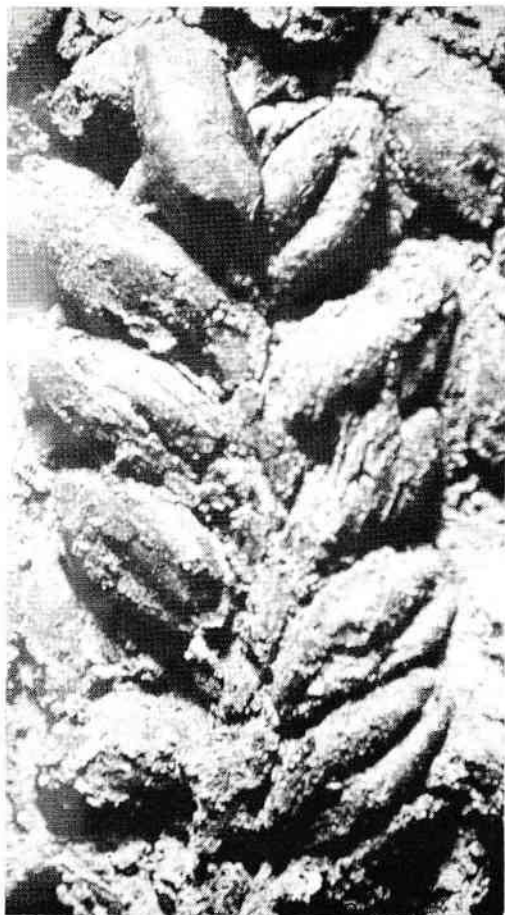
ABOVE: A spike of carbonised emmer wheat ( Triticum dicoccum ).

Beyond all the potential indicators of management and farming practice the sheer range and abundance of arable weeds is quite remarkable. The strikingly beautiful flowers of corn flower ( Centaurea cyanus ) and corn cockle ( Agrostemma githago ), pheasant's eye ( Adonis annua ) and poppy ( Papaver rhoeas ) are complemented by the delicate corn violet ( Viola arvensis ), forget-me-nots ( Myosotis arvensis ) and speedwells ( Veronica persica ). This research programme devoted to the study of the cereals and arable weeds has isolated a particular problem. While a wide range of arable weed seeds have been recovered by excavation, presumably brought into the settlement either with the harvest or the straw, a number of arable weeds seem to escape the process. These are the ground hugging varieties like the corn violet and red bartsia ( Odontites verna ) which are missed by the sickle or scythe. Similarly those arable weeds whose seeds are wind-dispersed like the sow thistle ( Sonchus arvensis ) and dandelion ( Taraxacum sp. ) are poorly if at all represented. The fact that they may not be present or poorly represented does not necessarily mean that they were not there or even abundantly present. In contrast one arable weed which always appears and from its habit of entwining itself about