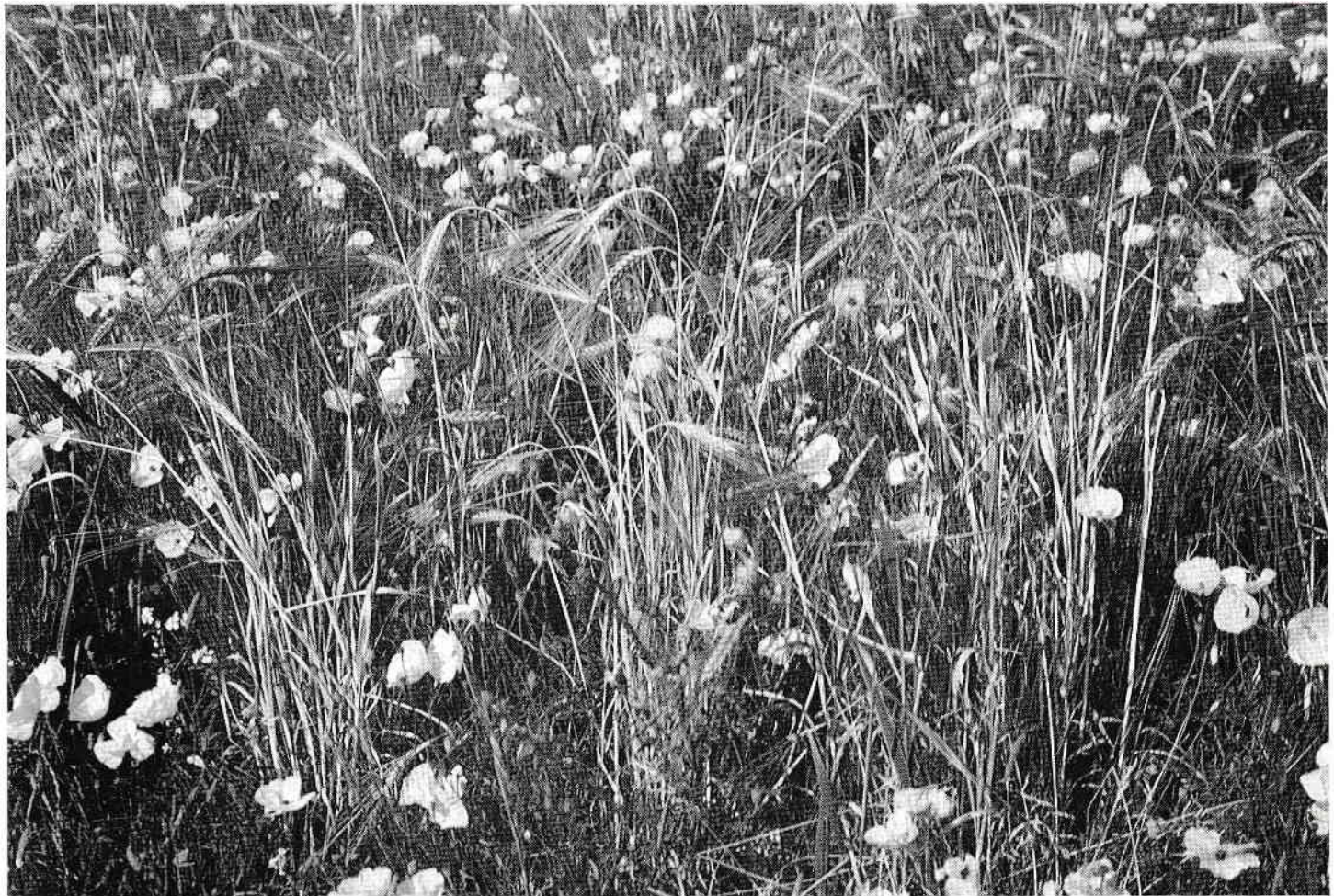
BELOW: Detail Emmer wheat and poppies.