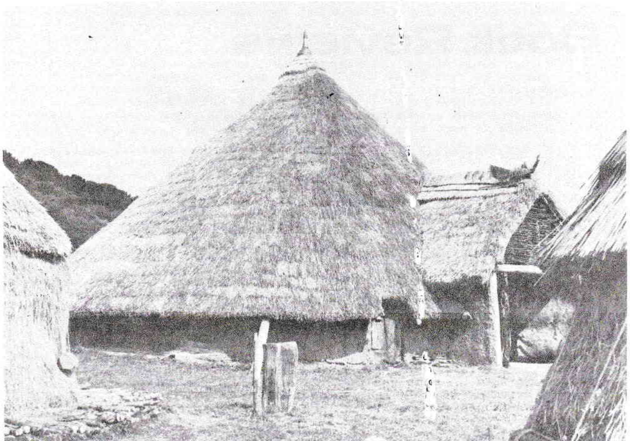
The Pimperne House at Butser Ancient Farm Research Project under construction and completed. (see page 12)